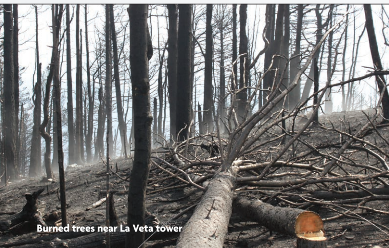
Burned trees near La Veta tower