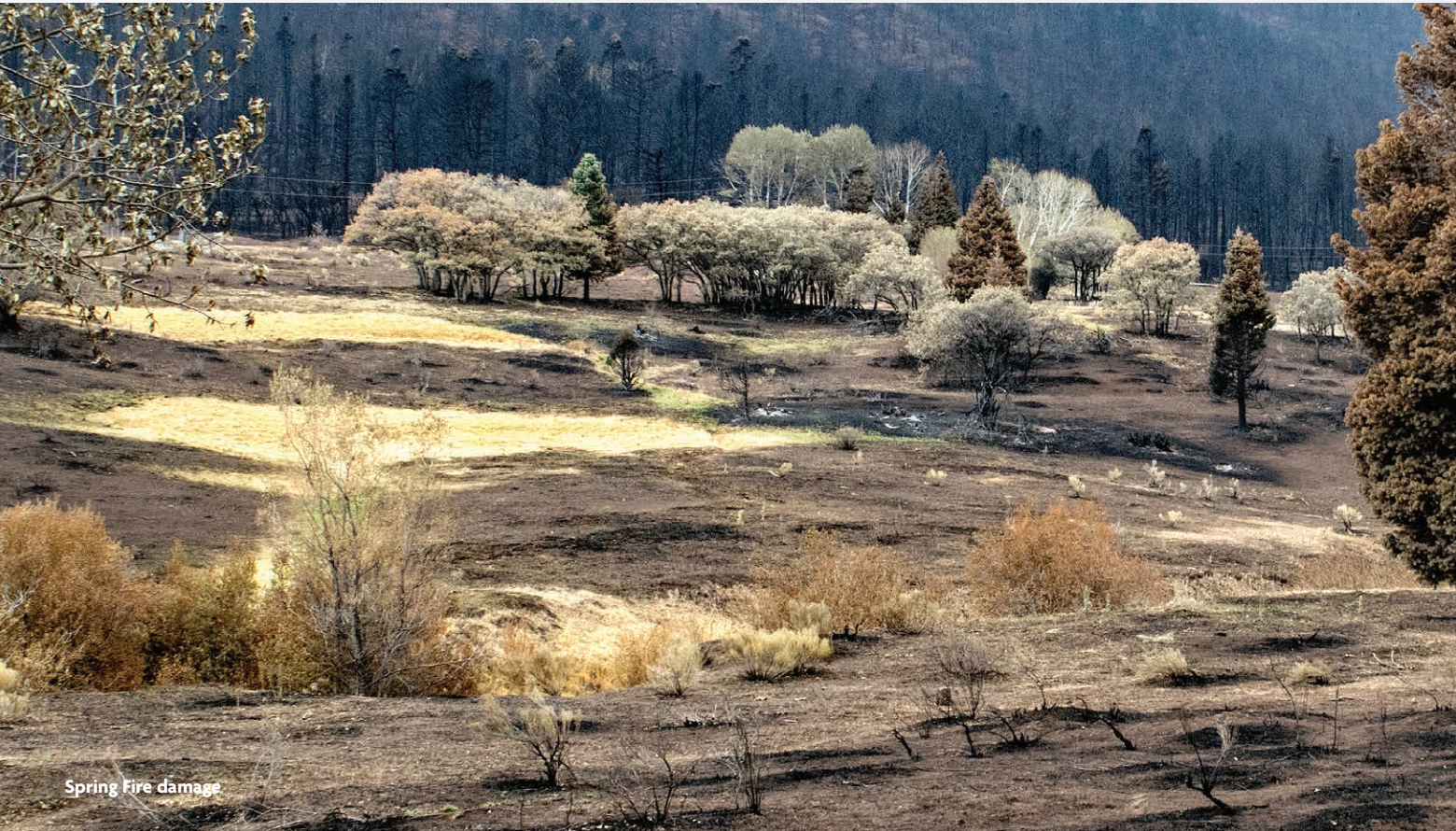
Spring Fire damage